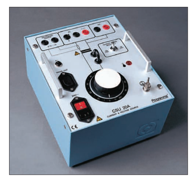
Current and Voltage Source (CSU20A)

AC, true RMS DC, mean value 0.00-600.0 \ {\rm V} AC, ±(1% + 200 mV) Max. value DC, ±(0.5% + 200 mV) Max. value. Values are range depending