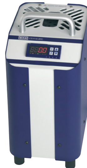
Temperature dry-well calibrator model CTD9100-ZERO